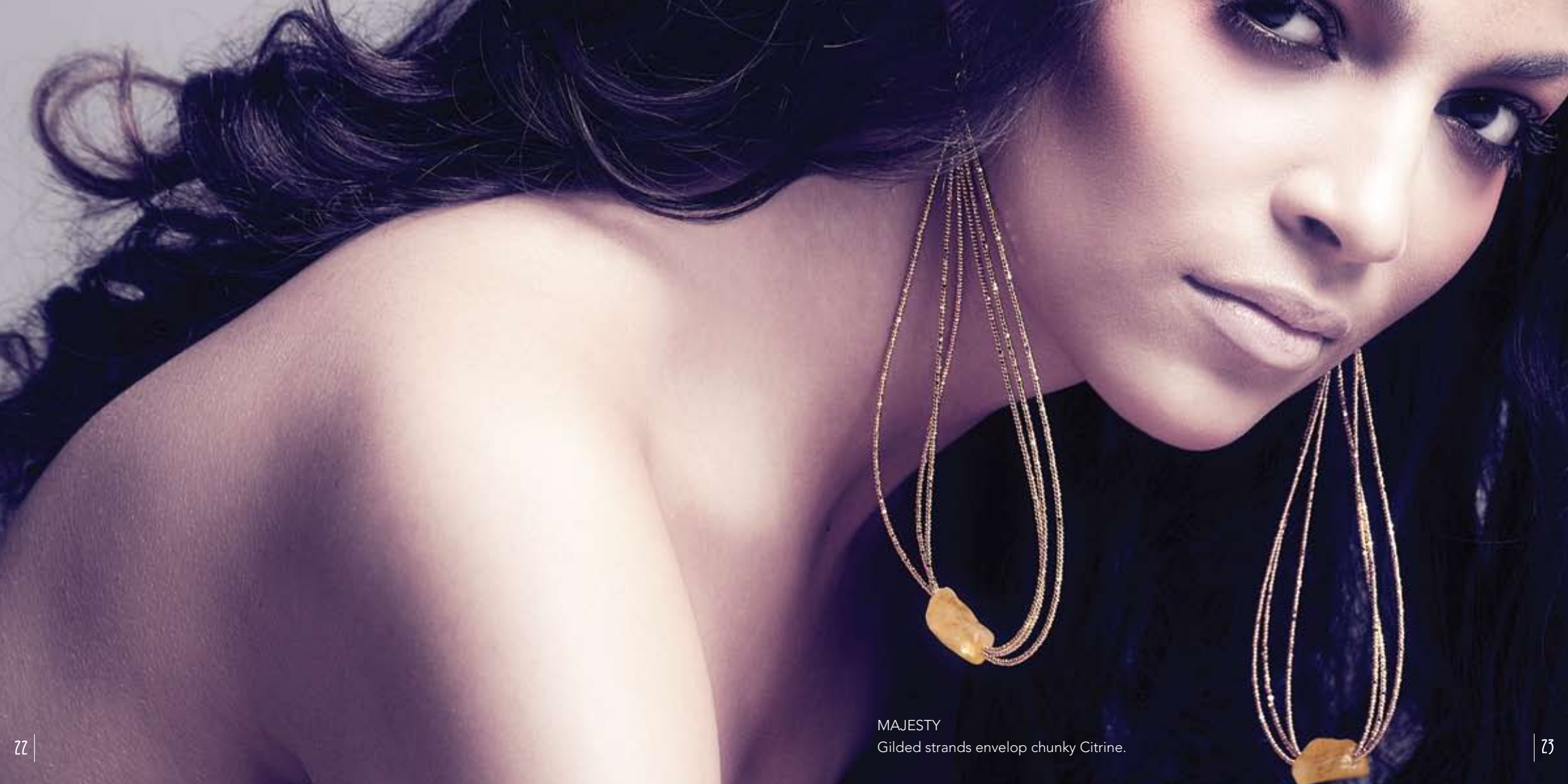
MAJESTY Gilded strands envelop chunky Citrine.